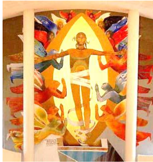
St. Paul de Meythet Church, France by Arcabas

O Lord God, our Father. You are the light that can never be put out; and now you give us a light that shall drive away all darkness.