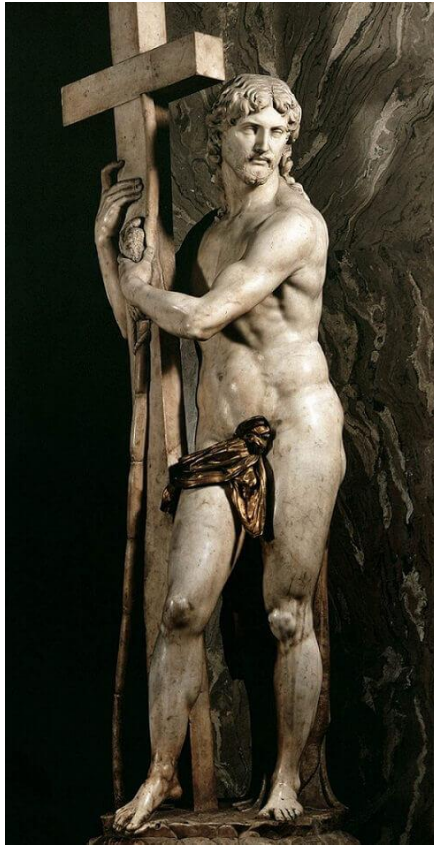
Risen Christ by Michelangelo, 1521