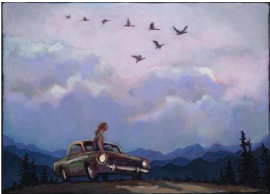
Dodge Dart (2020) by Carol Aust. www.carolaust.com Used with permission of the artist