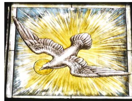
The Holy Spirit Descending - the Mary and Martha Window of St. Andrew's Church Kingston

Spirit of the living God, move among us all; make us one in heart and mind, make us one in love: humble, caring, selfless, sharing. Spirit of the living God, fill our lives with love. Book of Praise #400