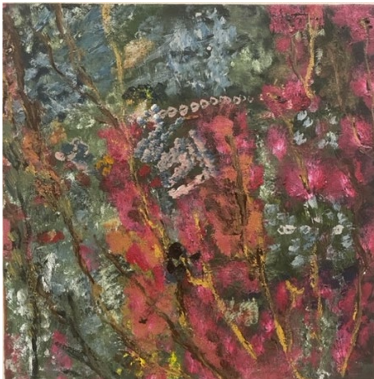
Fall Colours.