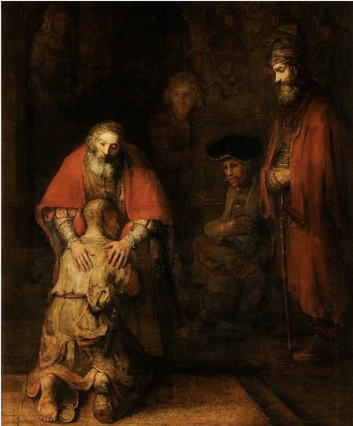
The Return of the Prodigal Son. Rembrandt van Rijn. 1668