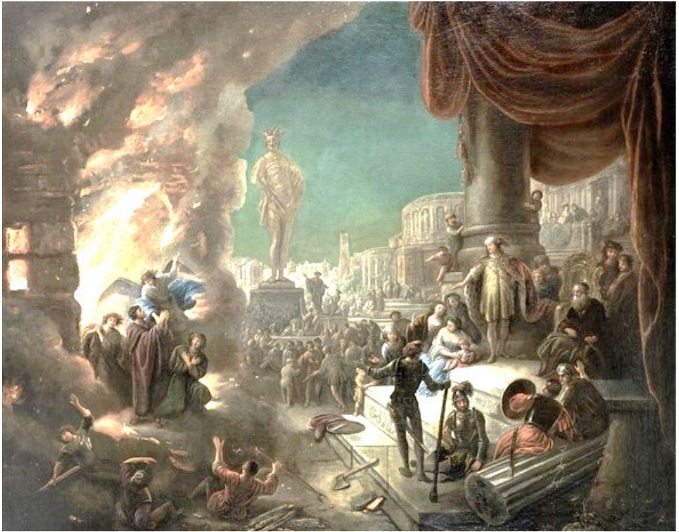
Shadrach, Meshach and Abednego in the fiery furnace.