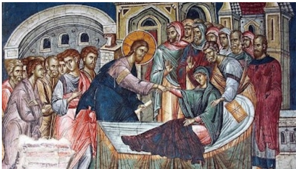
Icon of Christ Healing Peter's Mother-in-law. Visoki Dečani Monastery Church, Kosovo