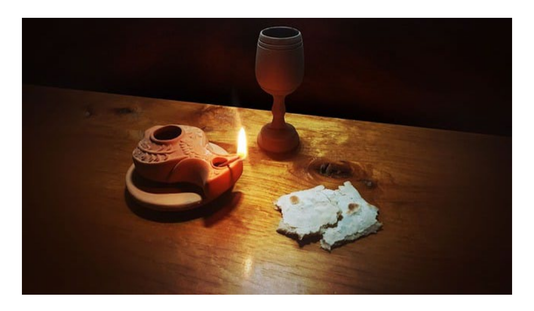
Communion.