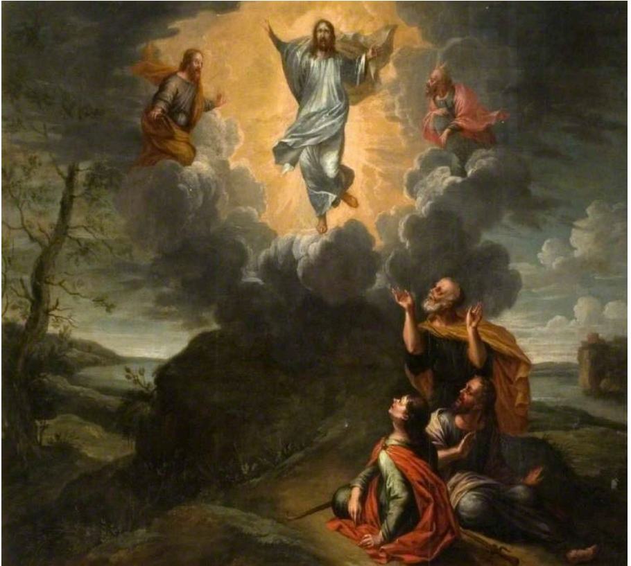
The Transfiguration of Christ. Flemish school, undated